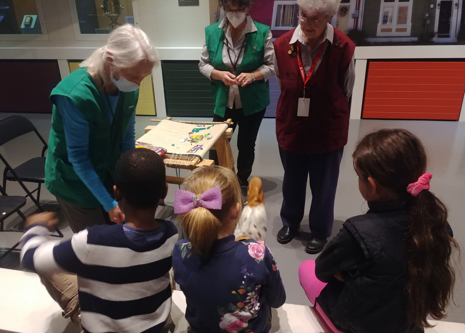
The Rooms education volunteers work with children during a visiting school program.