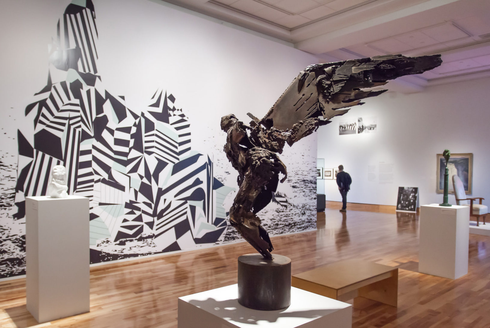
Installation view of the exhibition Future Possible: An Art History of Newfoundland and Labrador