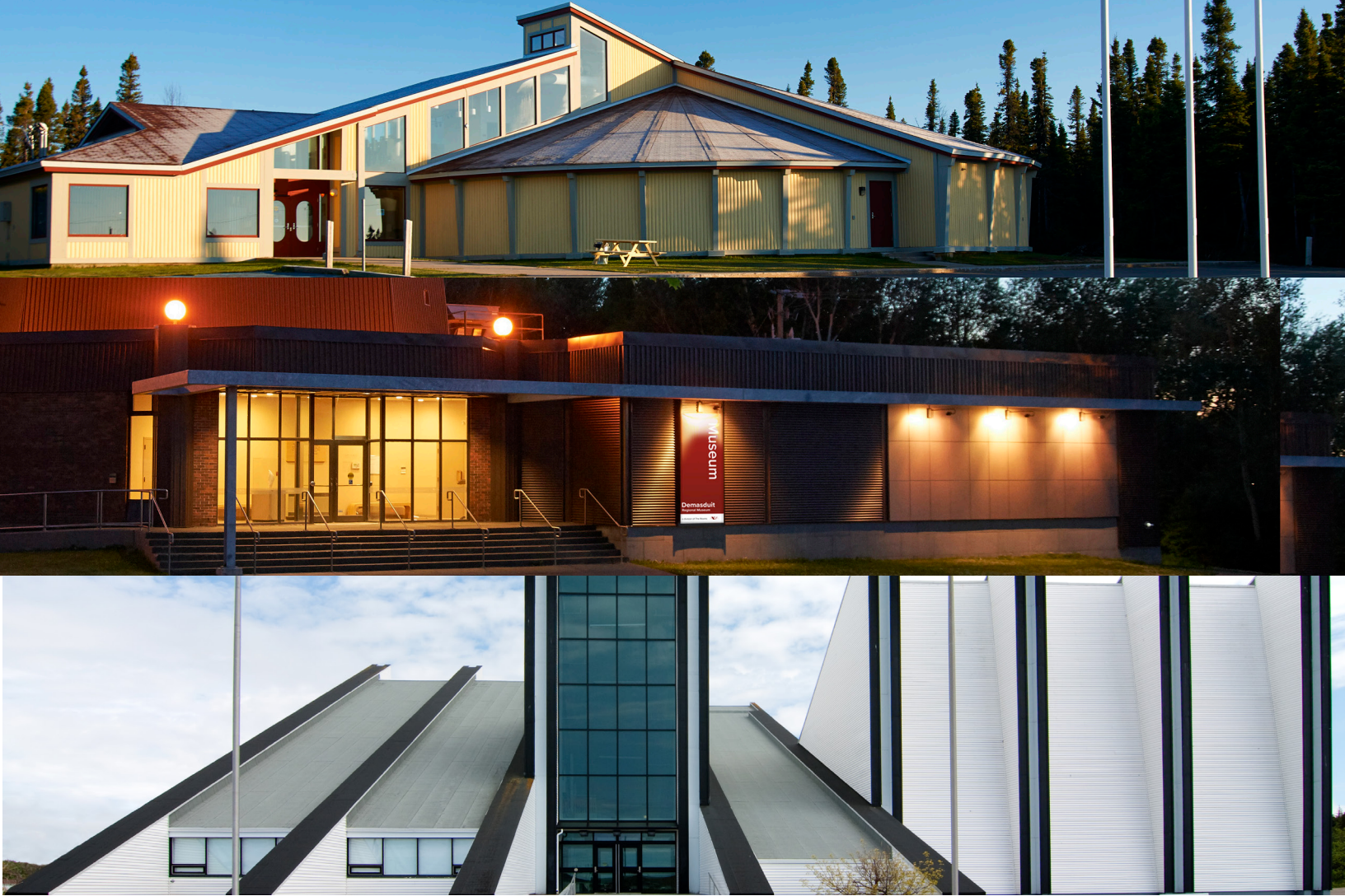
The Labrador Interpretation Centre, Demasduit Regional Museum and The Provincial Seamen’s Museum