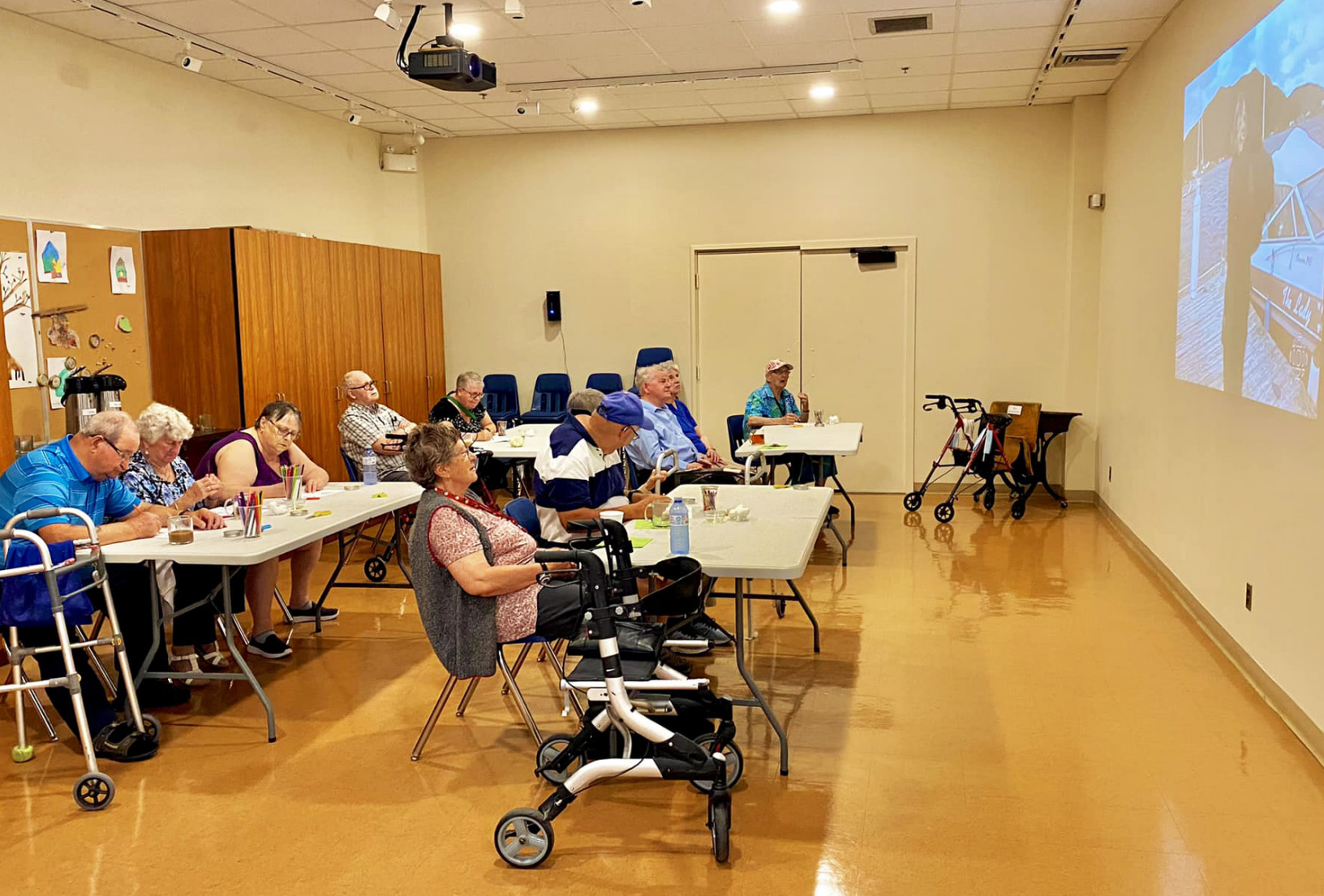
A seniors group from Grand Falls-Windsor area, participate in a program at the Desmasduit Regional Museum.